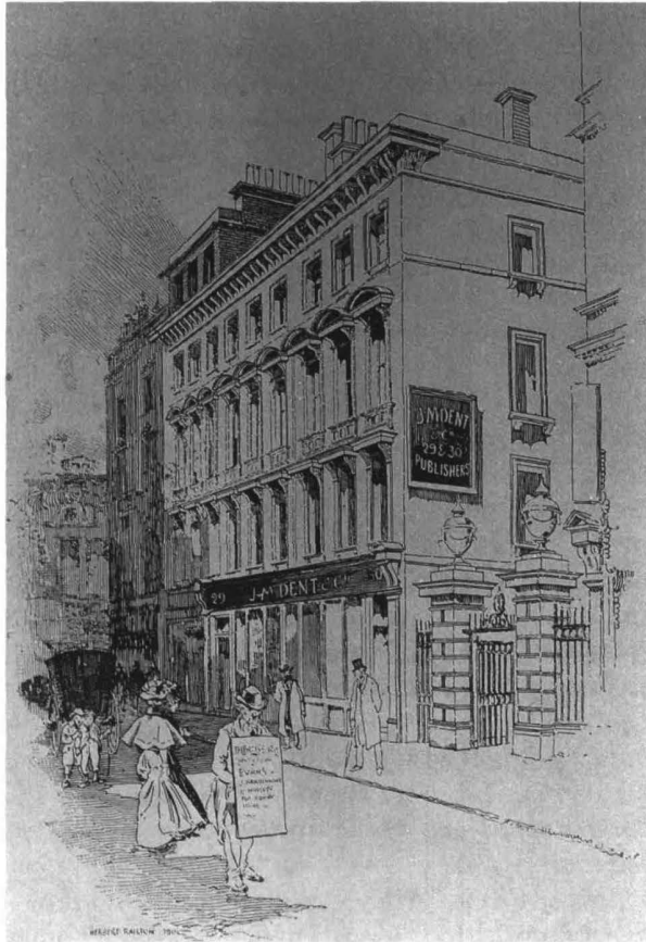
The building at 29-30 Bedford Street, London, where J. M. Dent and Company moved at the end of 1897

Niccolò Machiavelli's The Prince (1908), and included Richard Hooker's Of the Laws of Ecclesiastical Polity (1907); four volumes by Emanuel Swedenborg (1909, 1912, 1913, 1933); Benedict de Spinoza's Ethics and "De Intellectus Emendatione" (1910), introduced by George Santayana; the works of George Berkeley (1910) and David Hume (1911); John Keble's The Christian Year (1914); Thomas Hobbes's Leviathan (1914); and Friedrich Nietzsche's Thus Spake Zarathustra (1933). The library also included seminal works of science that, in the twentieth century, are hardly ever read: Sir Francis Galton's Inquiries into Human Faculty and Its Development (1907), Robert Boyle's The Sceptical Chymist (1911), Michael Faraday's Experimental Researches in Electricity (1912), Sir Charles Lyell's The Geological Evidence of the Antiquity of Man (1914), Thomas Malthus's An Essay on the Principle of Population (1914), and Darwin's The Origin of Species (1928).